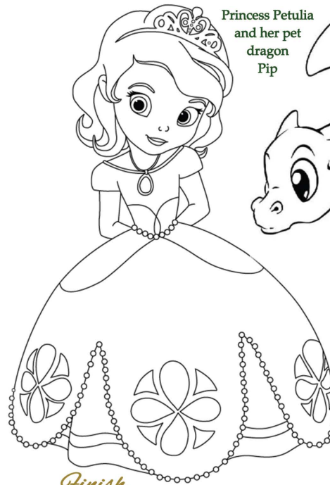
Princess Petulia and her pet dragon Pip

Guests with allergies should make a member of the team aware before placing an order for food or beverages. Allergen information is available on request from your server. If you have any questions regarding our menu please do not hesitate to ask a member of staff.